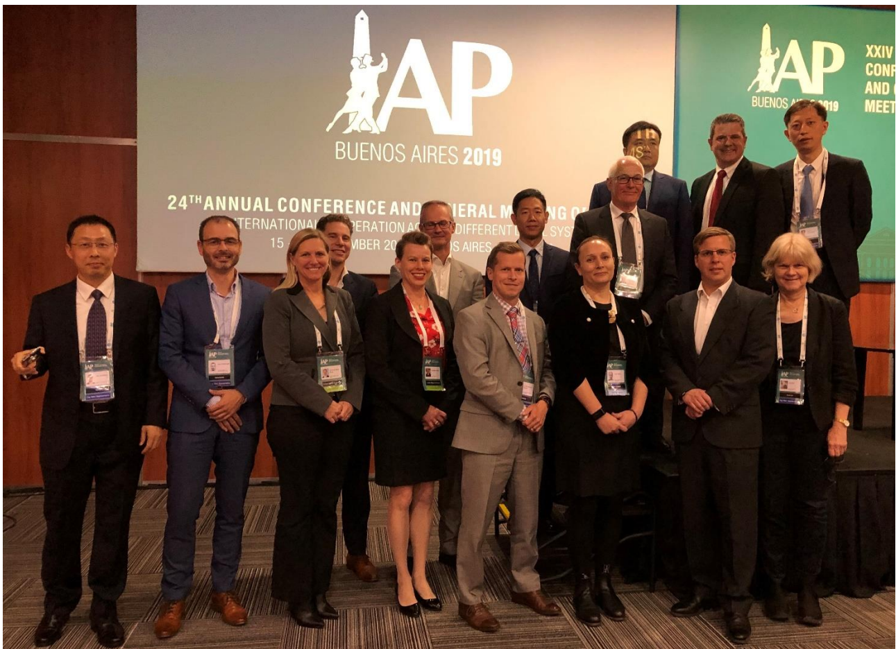
Representatives from seven jurisdictions participated in the NMP Round discussion.

Seven jurisdictions participated and took part in the interesting exchange of views and experiences during in the Round Table – including Canada, New Zealand, Australia, the Netherlands, the United States, the Peoples Republic of China and Denmark. The Roundtable concluded to continue with the format of the NMP activities in the next Conference in Athens 2020.