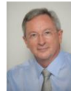
Hon Brad Hazzard MP Attorney General New South Wales