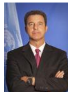
Serge Brammertz Prosecutor for the International Criminal Tribunal for the former Yugoslavia