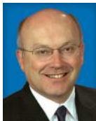
Hon George Brandis QC Attorney General Commonwealth of Australia