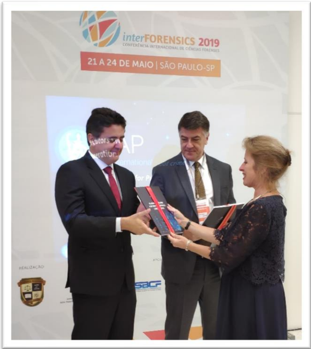
Presenting of the Guidelines