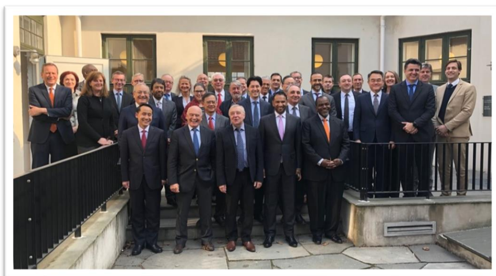
The 47th Executive Committee Meeting hosted in Oslo, Norway, 4-5 April 2019.