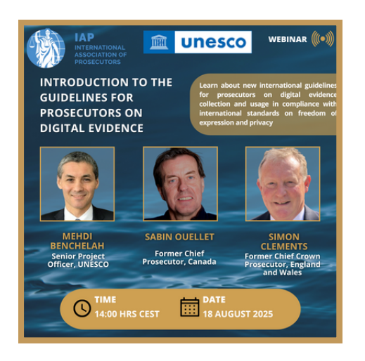
Introduction to the Guidelines for Prosecutors on Digital Evidence