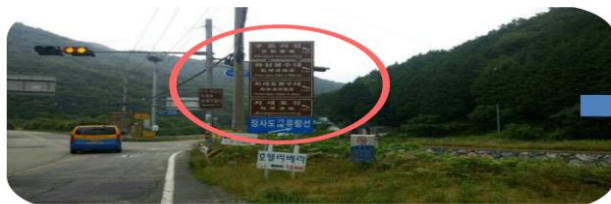
Before (시야확보 불가)