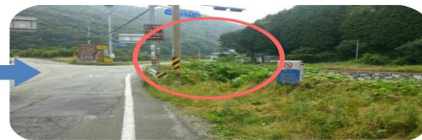
After (시야확보 가능)