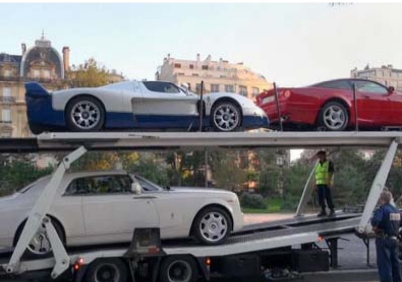
exsmolik ( The Guardian 2012)